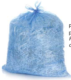
Place in clear plastic bag. Poner en bolsas de plástico claras.