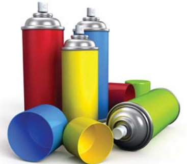
Empty only! Non-hazardous materials. Solamente materiales que no sean toxicosor peligrosos.