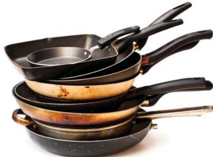
No sharp objects No objetos filosos